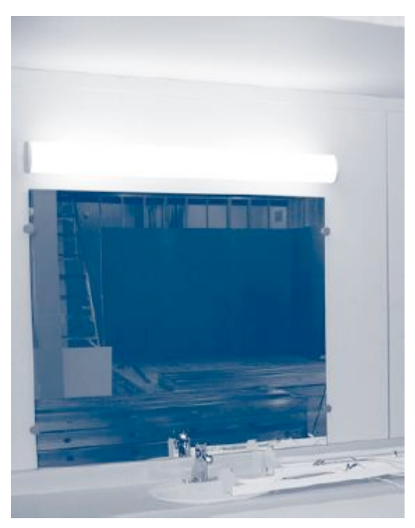
Figure 2-3: Speclight Smart Vanity Light

Speclight has integrated the HN controller into one of their linear fluorescent fixtures and developed a product called the Smart Vanity Light. Speclight's Smart Vanity Light is applicable to new construction and major remodels.