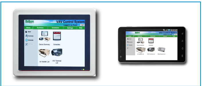
Integrate Rebel with your tablet or phone using our web enabled touchscreen automation system!

For information on the Daikin McQuay Rebel system or for our full line of product offerings, visit: www.mcquay.com